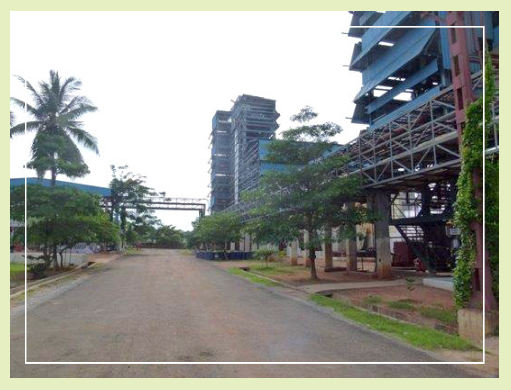
SBT Biodiesel Plant - Visakhapatnam