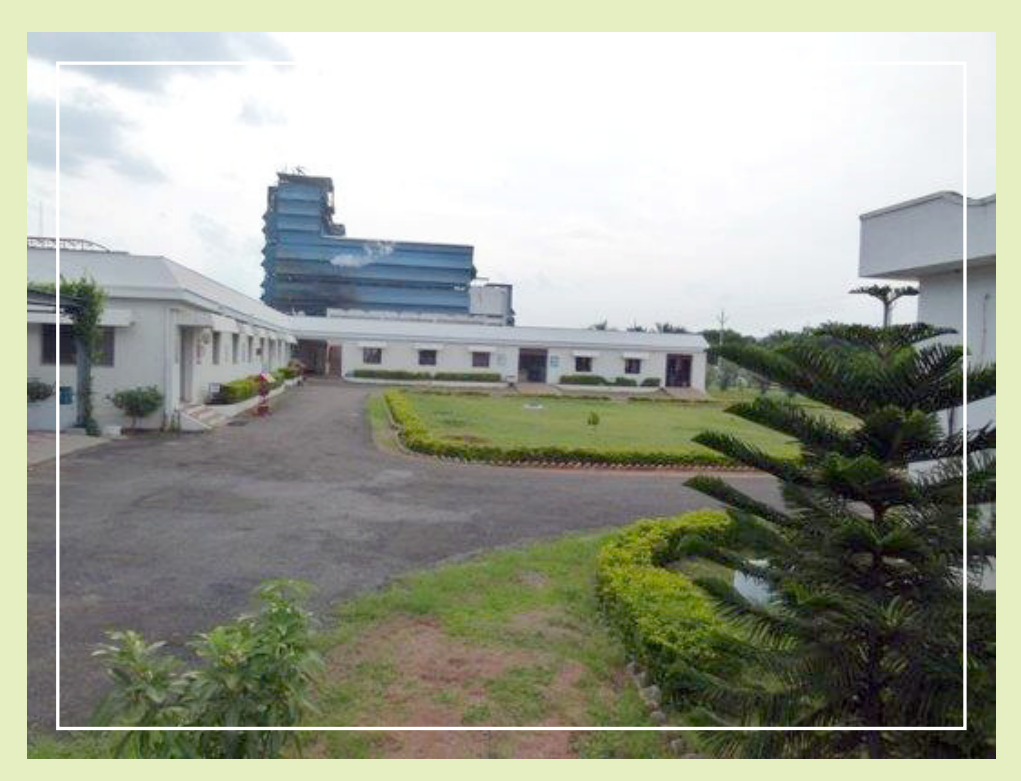
SBT Biodiesel Plant - Visakhapatnam