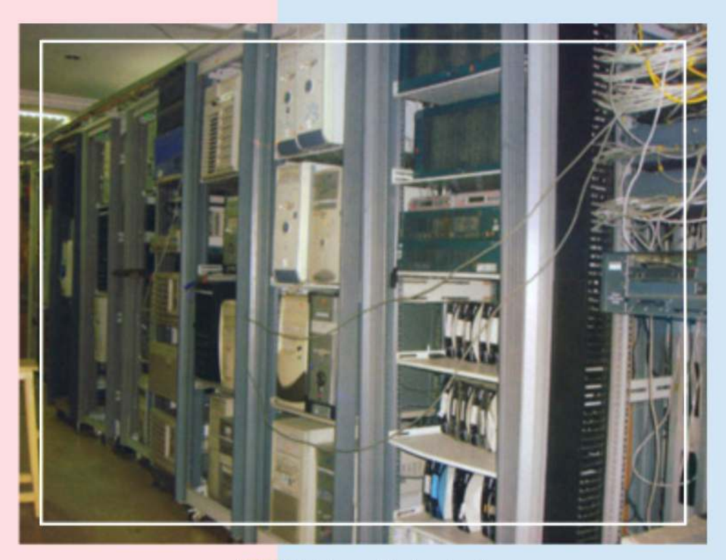
ISP Division - Hyderabad