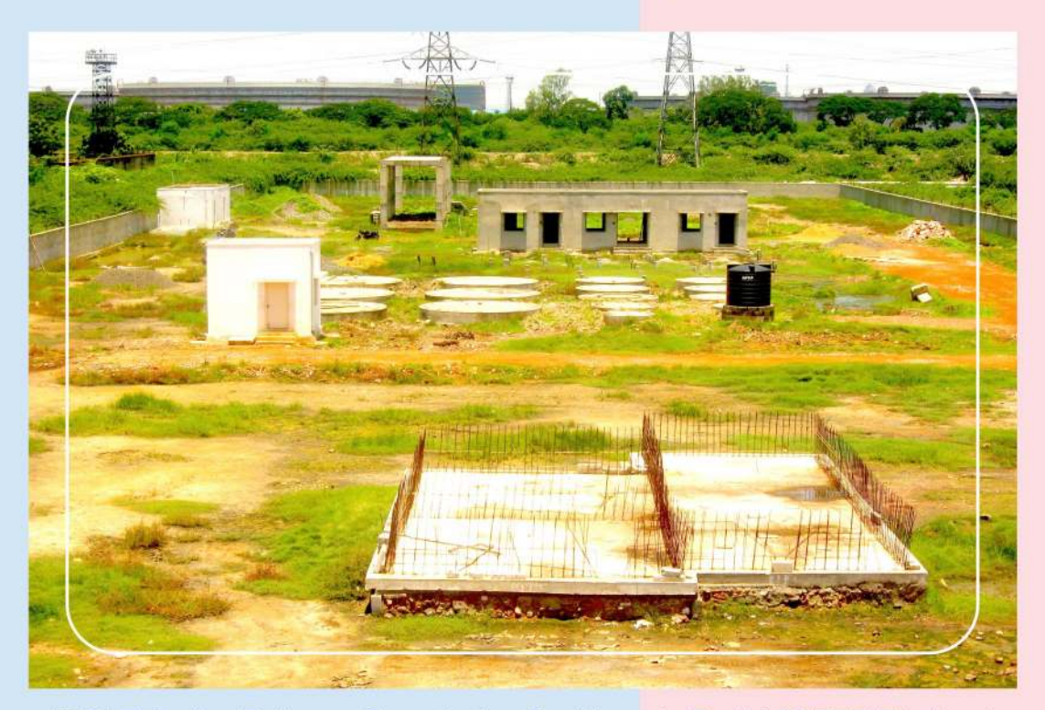
IROAF (Indian Railways Organisation for Alternate Fuels) 30 TPD Biodiesel Plant at Tondiarpet, Chennai under implementation by SBT